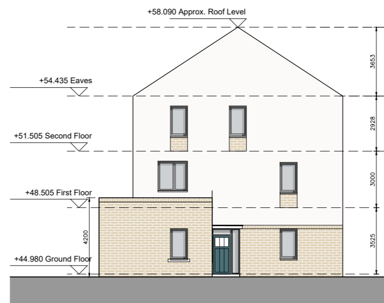
DUPLEX BLOCK D SIDE ELEVATION (WEST)