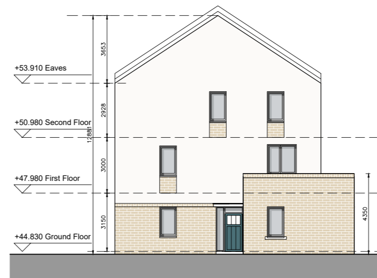
DUPLEX BLOCK D SIDE ELEVATION (EAST)