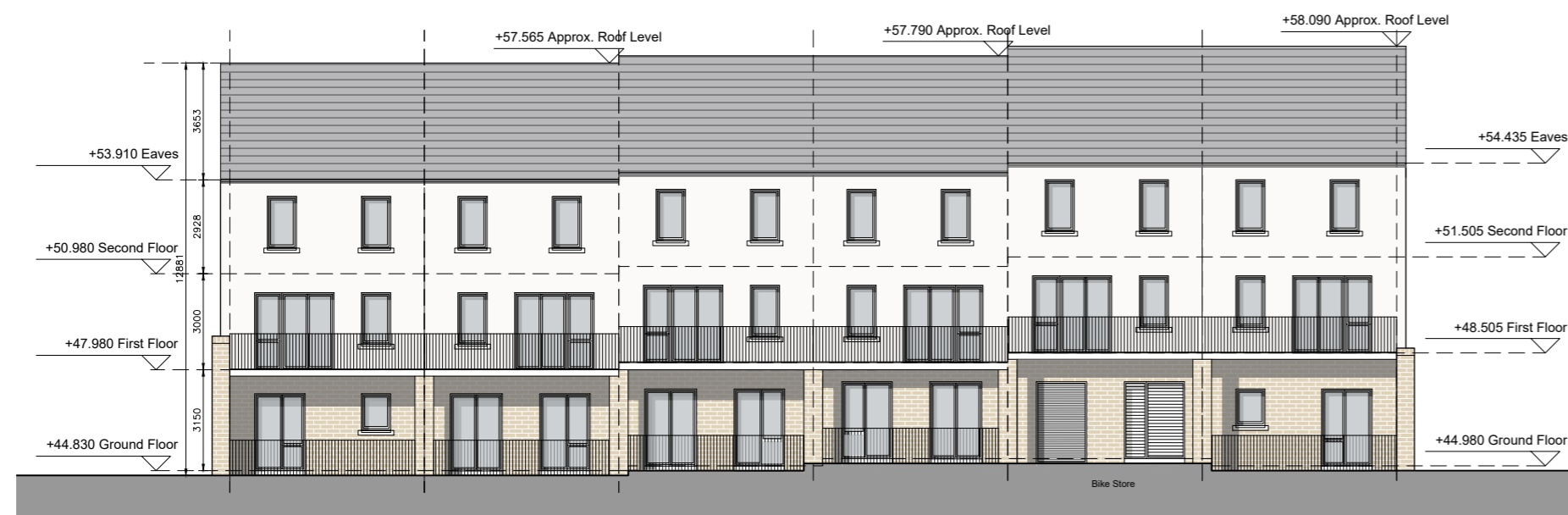
DUPLEX BLOCK D REAR ELEVATION