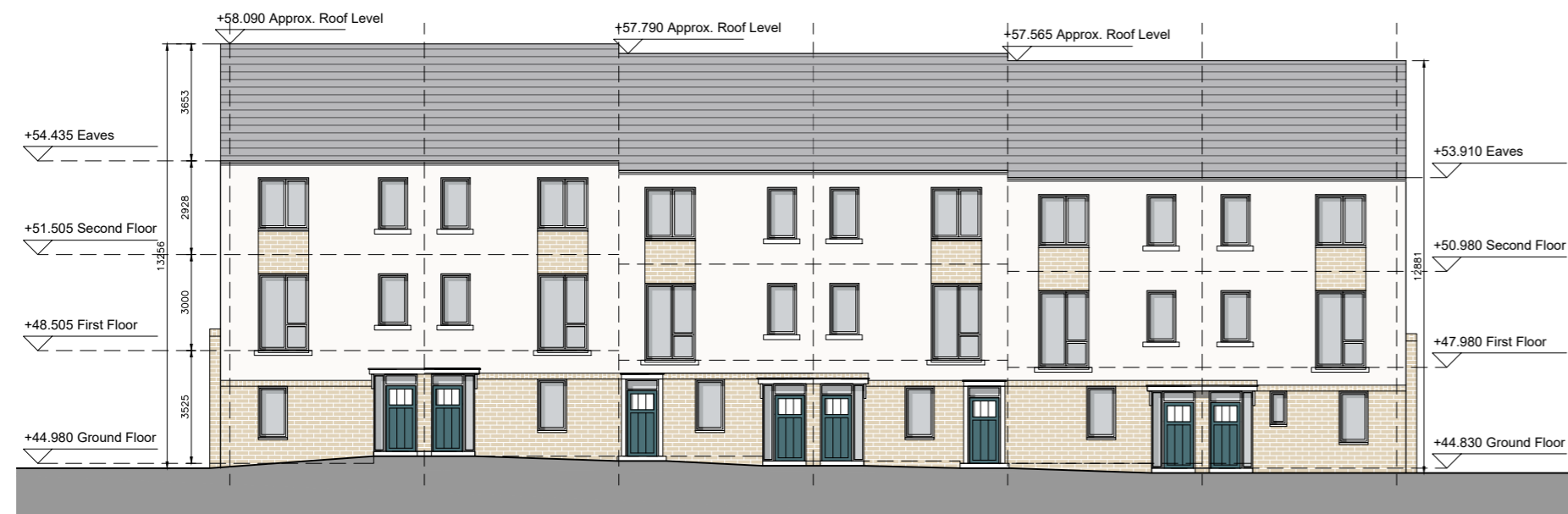
DUPLEX BLOCK D FRONT ELEVATION