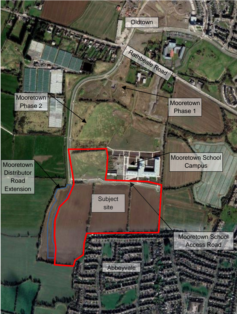
Figure 1 | Site Location

The Mooretown School Access Road has been constructed, and completed, under planning reference number: F14A/0012. The northern portion of the Mooretown Distributor Road from the Rathbeale Road has been constructed under planning reference number F12A/0270. The Mooretown Distributor Road Extension as shown with a blue boundary in Figure 1 below, has received decision to grant of planning permission, and has an application reference number of: F20A/0096. We also refer you to site layout drawing P1000 accompanying this report.