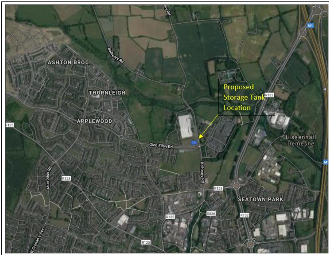
Figure 1 | Site Location

The proposed site for the Stormwater storage tank is located on the junction of the Glen Ellan Road and the Balheary Road, Swords, Co. Dublin, as indicated in Figure 1 below. The site is 1.4km north of Swords, 1.1km west of the M1 motorway and 300m south of the Broadmeadow River. The site is owned by The Applicant and is locally referred to as the Celestica/Motorola site.