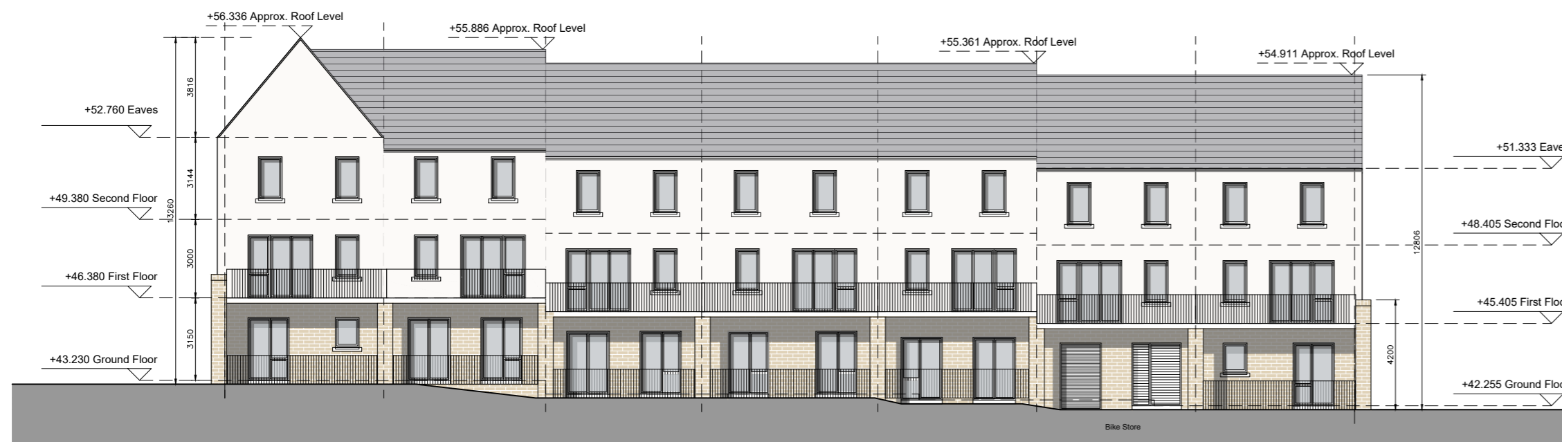
DUPLEX BLOCK A REAR ELEVATION