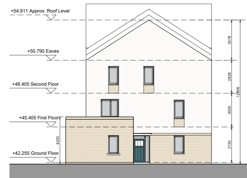
DUPLEX BLOCK A SIDE ELEVATION (EAST)