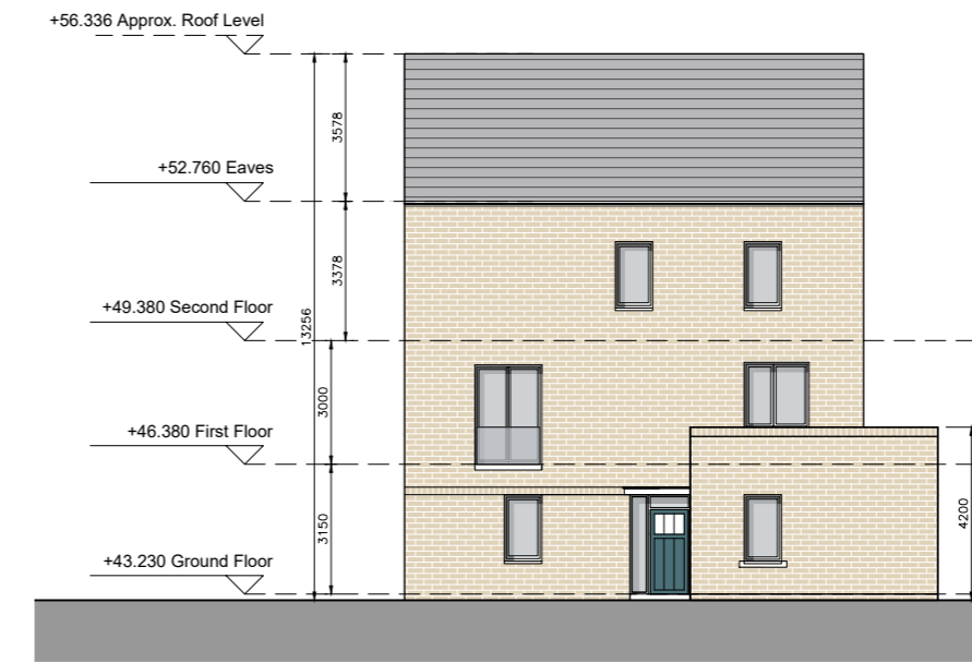
DUPLEX BLOCK A SIDE ELEVATION (WEST)