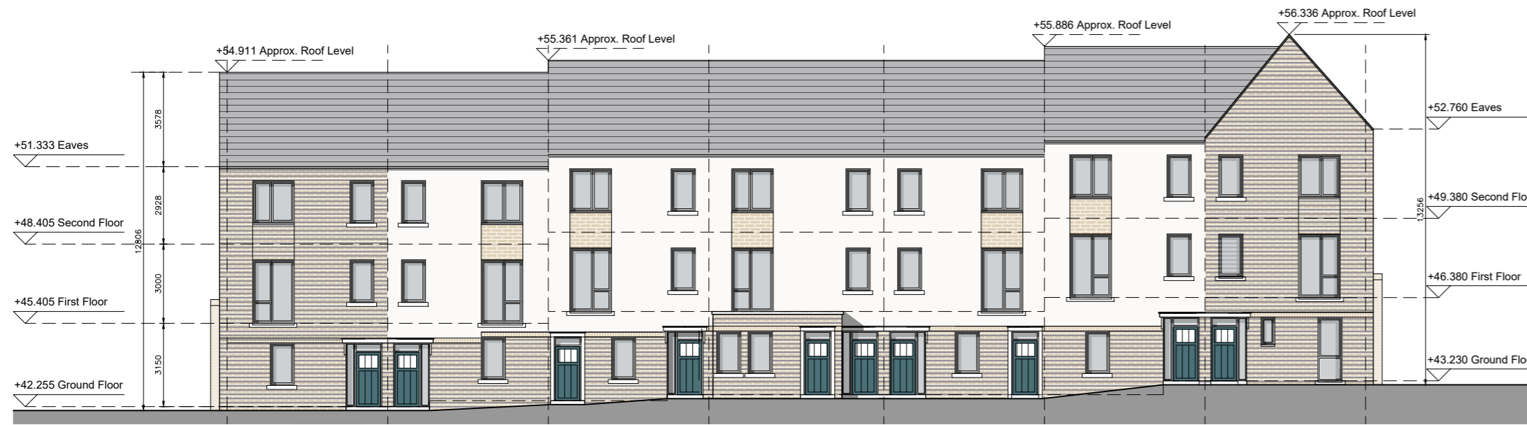
DUPLEX BLOCK A FRONT ELEVATION