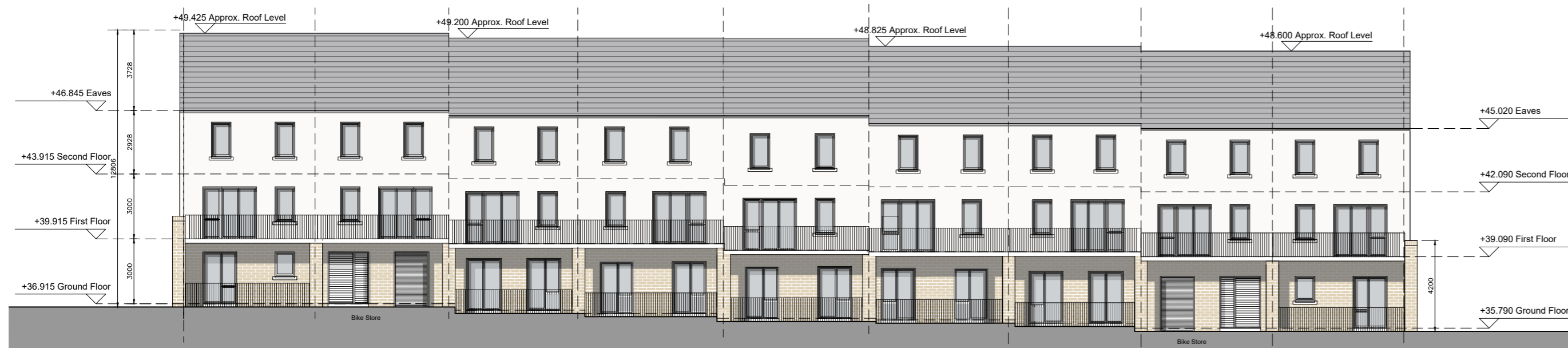
DUPLEX BLOCK K REAR ELEVATION