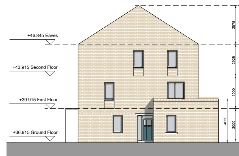
DUPLEX BLOCK K SIDE ELEVATION (WEST)