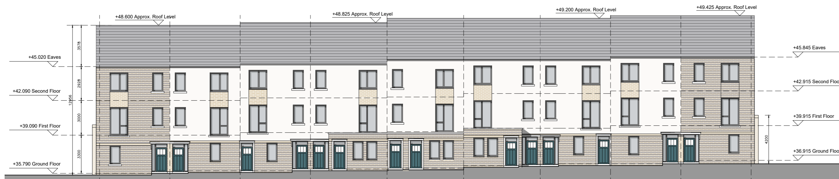
DUPLEX BLOCK K FRONT ELEVATION