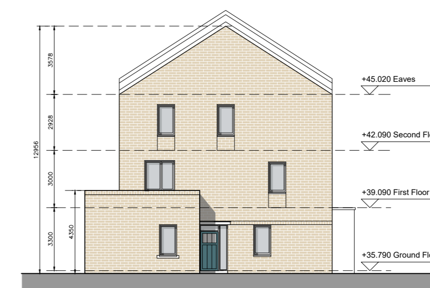
DUPLEX BLOCK K SIDE ELEVATION (EAST)