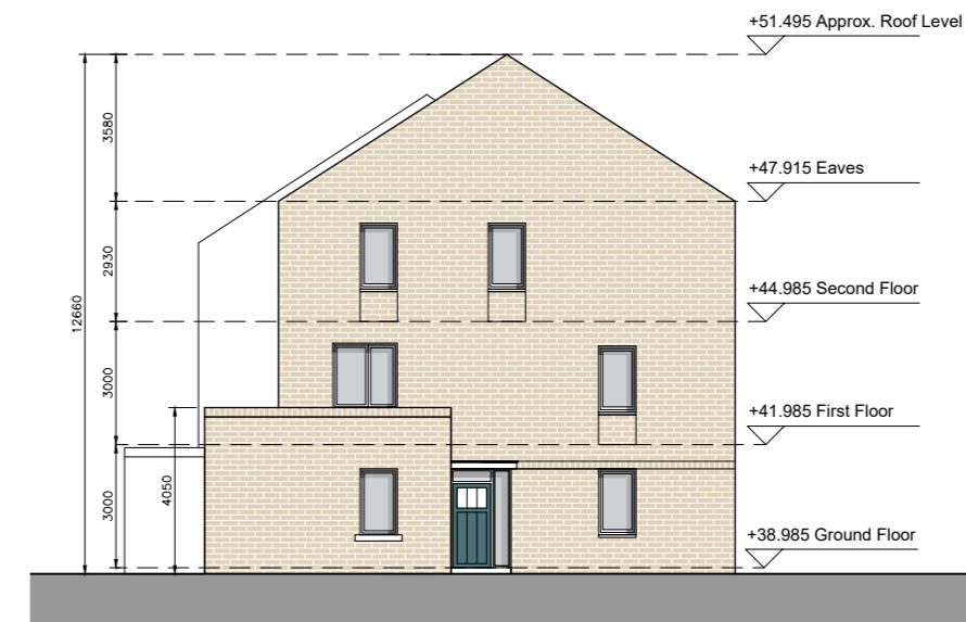
DUPLEX BLOCK Q SIDE ELEVATION (SOUTH)