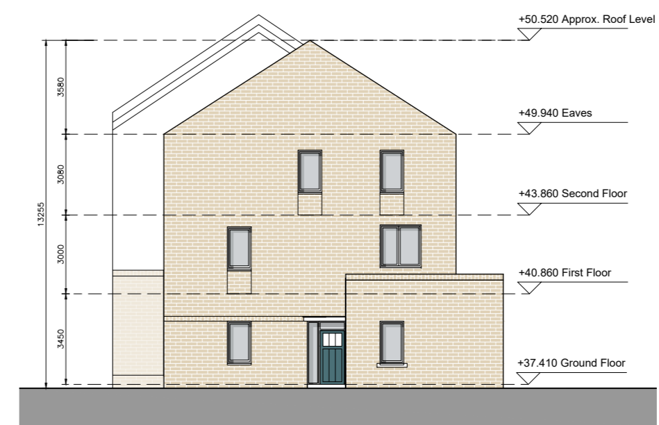
DUPLEX BLOCK Q SIDE ELEVATION (NORTH)