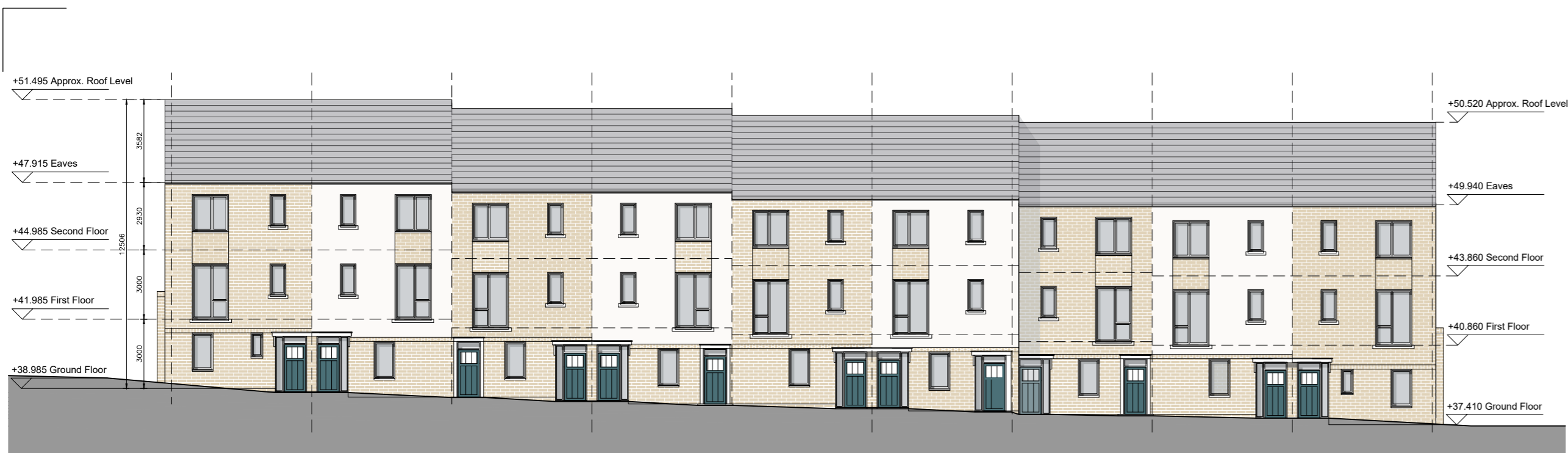
DUPLEX BLOCK Q FRONT ELEVATION