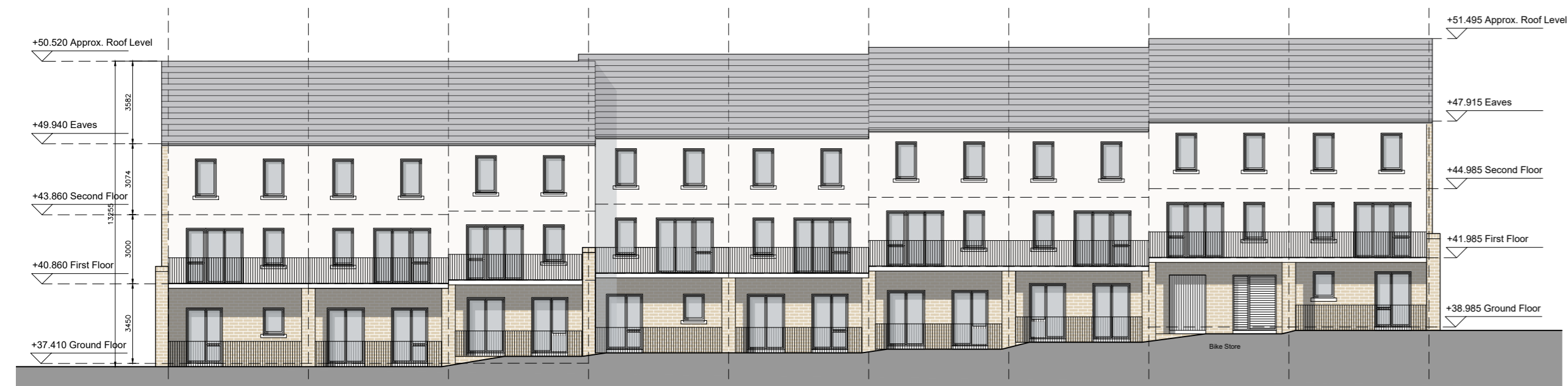
DUPLEX BLOCK Q REAR ELEVATION