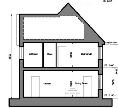
Section A-A 1:200